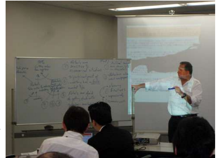
MT Basic WS →