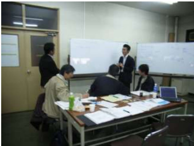
←CCPM Basic WS