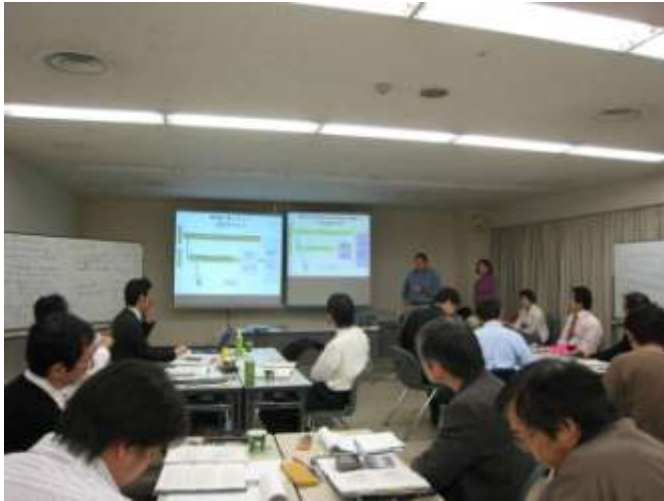
←SDBR Basic WS