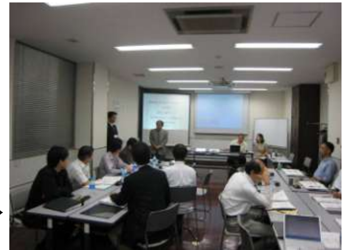
SCM Basic WS →